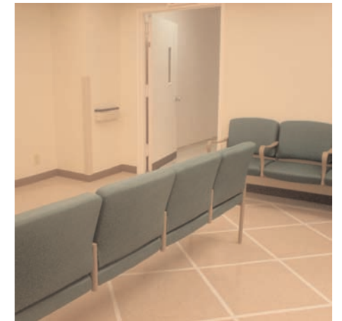
Almost completed renovations in dialysis waiting room

RI's Human Resources and Finance Offices located on the fifth floor at 504 East 74th Street have also been updated. The space was redesigned and refurbished to allow for a spacious waiting area in