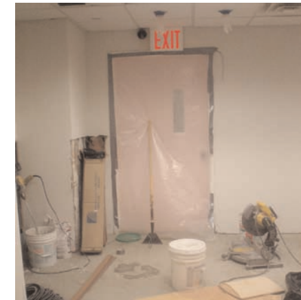
Dialysis waiting room undergoing renovations

The Institute's Helmsley Tower second floor lobby, hallways and dialysis waiting room have been renovated. The dialysis center's waiting room has been totally refurbished; giving patients, families and friends a more cheerful, comfortable space while waiting. The Manhattan Dialysis Center is such an active center with four shifts that all the hallways and floors, in need of a facelift, were refinished with new wallpaper and new flooring. In addition, all the lighting was reconfigured to provide a brighter, more pleasant ambiance. Patients and staff are very pleased by the new surroundings. RI is appreciative of the wonderful staff who, under the guidance of Pat, Nurse Administrator, helped the renovation proceed as smoothly as possible for our patients. The construction and furniture were supported in part by a generous grant from The Horace W. Goldsmith Foundation.